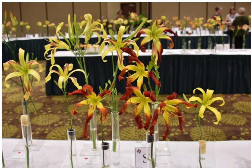
2015 LDS Flower Show We had a total of 207 scapes competing