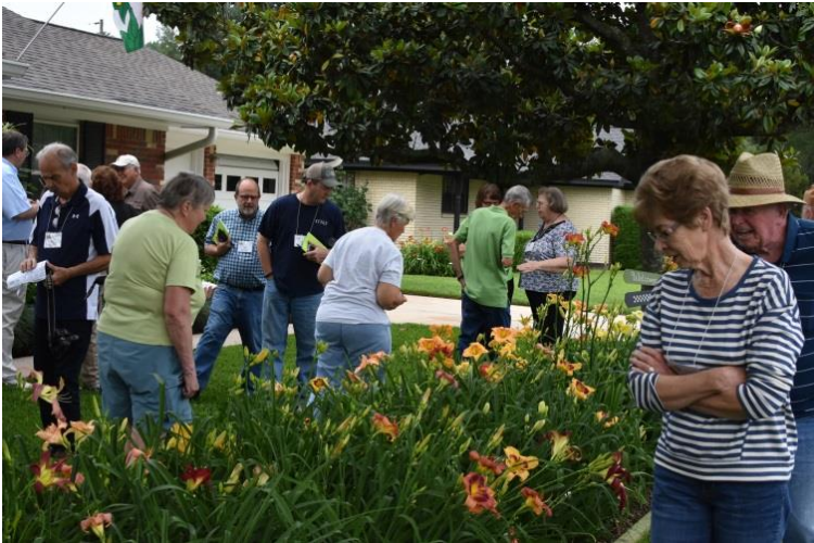
Eskine Garden Tour – 2015 Regional Meeting