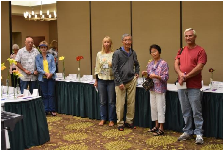
2015 LSDS Flower Show Winner